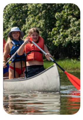
Memorable Experiences Girl-centered adventures and service initiatives