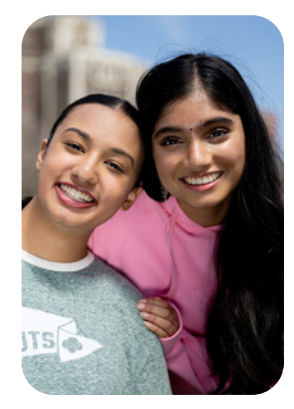
Lifelong Sisterhood Friendships and a strong community, locally and beyond